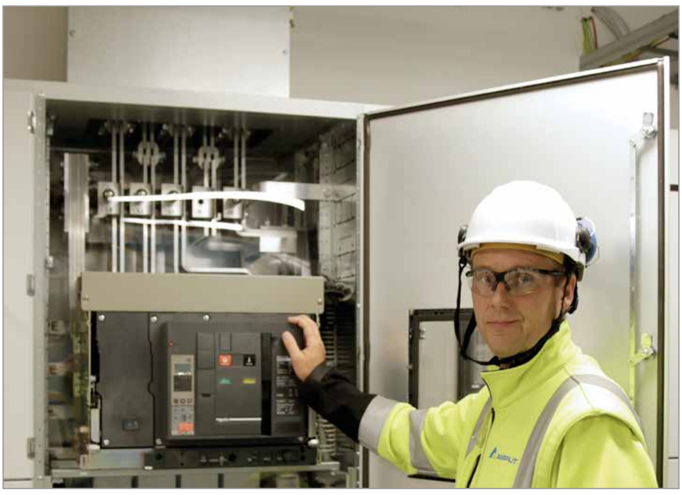
The new children's hospital - The busbars for the Children's Hospital were designed and manufactured by Lapp Connecto, and installed in July-August 2017. The hospital environment poses special demands for magnetic fields around busbars.