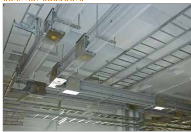
JL BUSBARS AND JKU TAP-OFFS